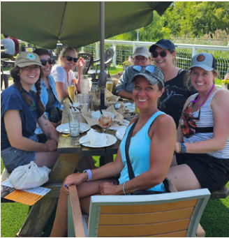
Event Attendees at Ghost Isle

After the tour, participants visited Ghost Isle to continue the camaraderie and discuss COL's work. The program engaged a total of 67 participants, many of whom were new to COL and have since become more involved and connected. There are no hiking trails on the Louis J. Sima Great