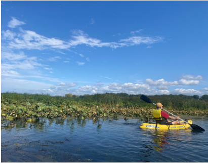
A Kayak and Brews Attendee Paddling the Galien River Marsh

This year's most popular new program was our Kayak and Brews summer series. We partnered with Ghost Isle Brewery to bring groups of 10-20 people out for kayak tours of the Galien River Marsh once a month from June to September.