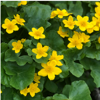
Yellow Marsh Marigold ( Caltha palustris )