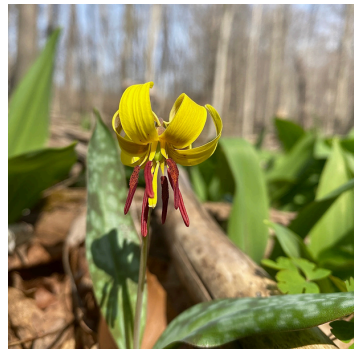
Yellow Trout Lily ( Erythronium americanum )