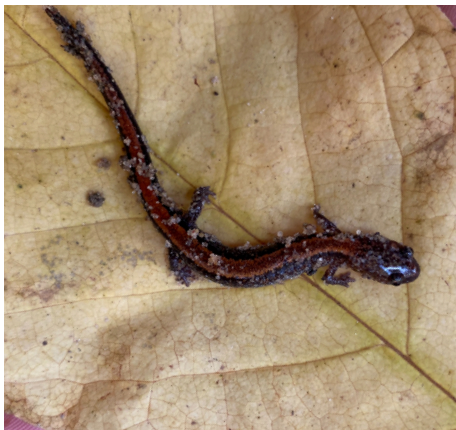
A red-backed salamander found on the property

The parcel features a lovely mature hardwood forest, scenic ravines, and a former agricultural area. The current property owners, Thomas and Eileen Chapman, were ready to sell the land, but they also wanted to see it remain in its undeveloped, natural state. So they reached out to COL, offering the land to us at a significantly discounted price. It was an opportunity we did not want to pass up.