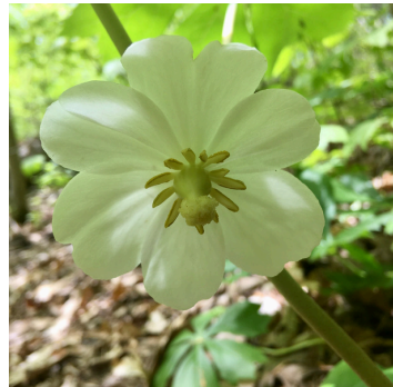
Mayapple ( Podophyllum peltatum )