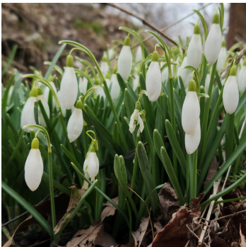
Snowdrop ( Galanthus nivalis )