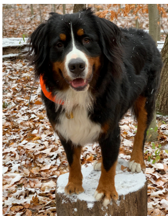
Tui on his log at Robinson Woods