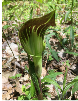
Jack-in-the-pulpit ( Arisaema triphyllum )

Flowers are some of the first splashes of color that emerge along the trails in COL's preserves each spring. We call them spring ephemerals, which is just a fancy way of describing plants that bloom for a short period during the spring. These plants are often the first signs of life to emerge after a long winter, some even making an appearance with snow still on the ground! Break in that raincoat, slide on some mud boots, and hit the trails to see how many spring ephemerals you can find!